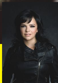
ROXANA CONSTANTINESCU MEZZO-SOPRANO